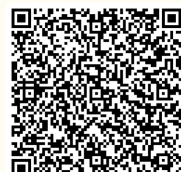
Foodys & Greenos